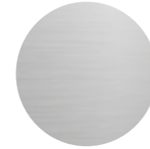
Solid stainless steel without presentation